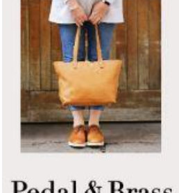
Pedal & Brass